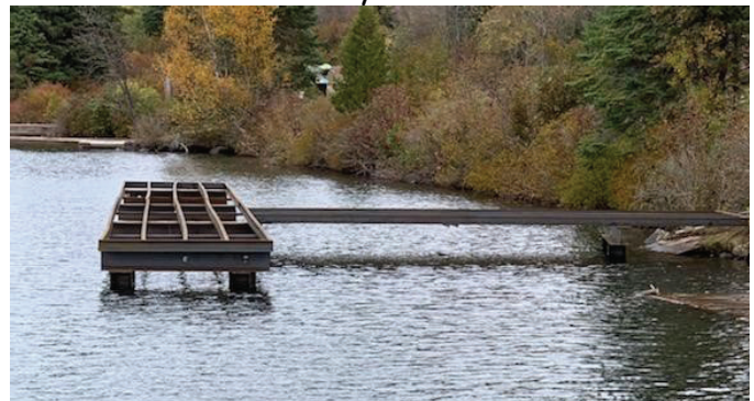
Construction progress of Windigo Finger dock.